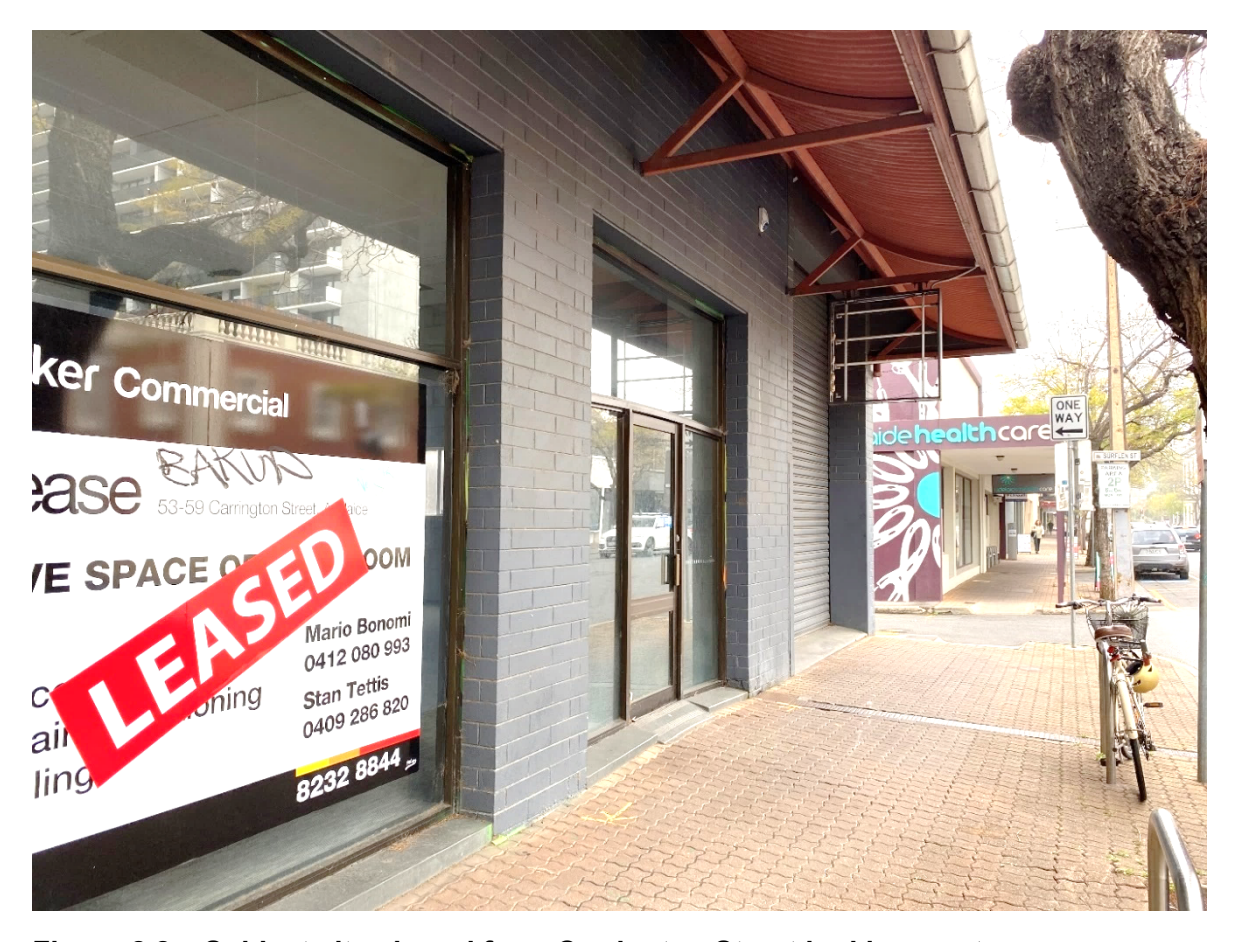
Figure 2.2 – Subject site viewed from Carrington Street looking west