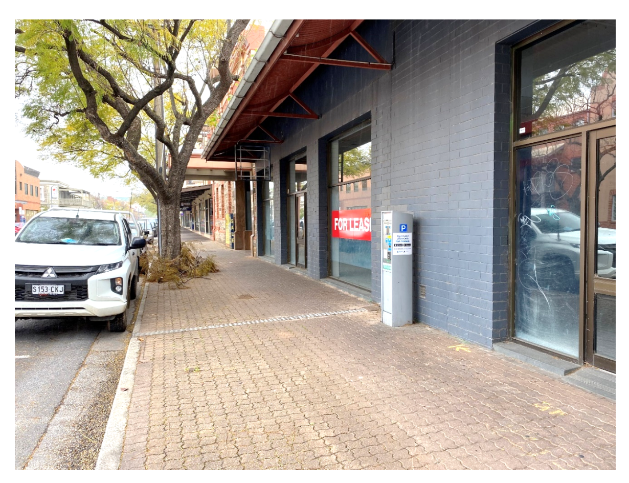
Figure 2.1 – Subject site viewed from Carrington Street looking east