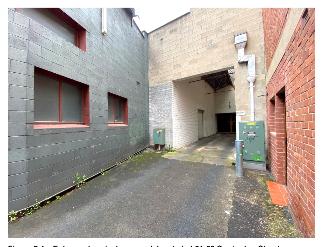
Figure 2.4 – Entrance to private car park located at 61-63 Carrington Street